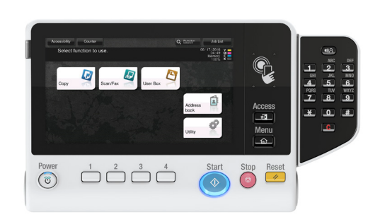
Innovative 7" Multi-touch Display Panel with NFC authentication area and optional Keypad (KP-101)

Configuration with 2 optional Paper Drawers and Copy Desk